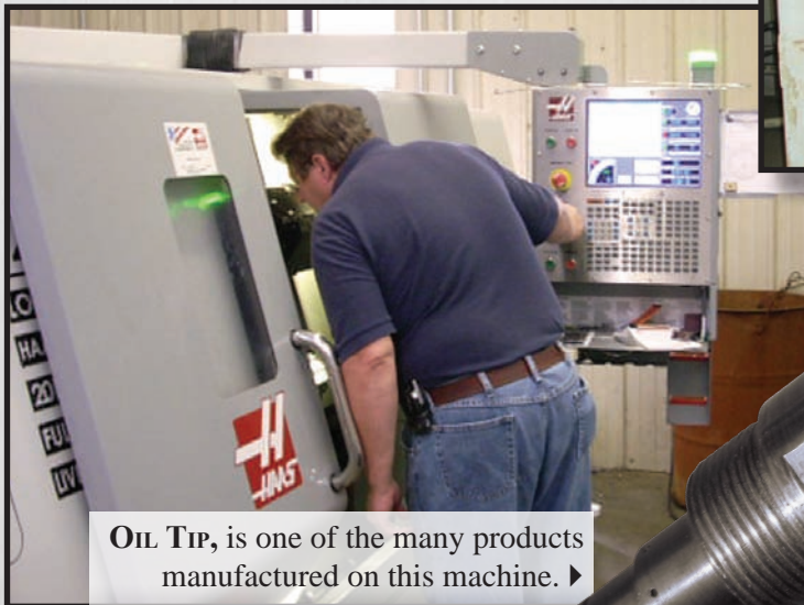
OIL TIP, is one of the many products manufactured on this machine. ▶