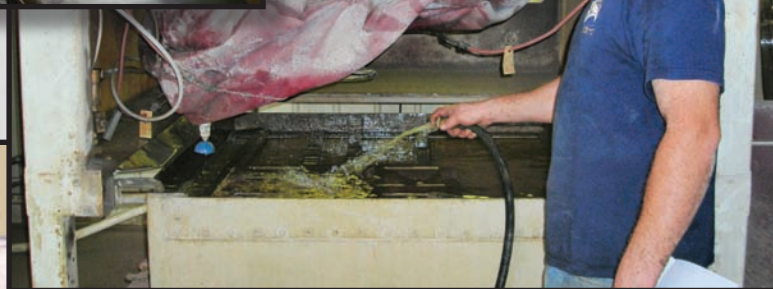
▲ WATERJET: Our precise cutting machine, the WaterJet, operated by Brad.